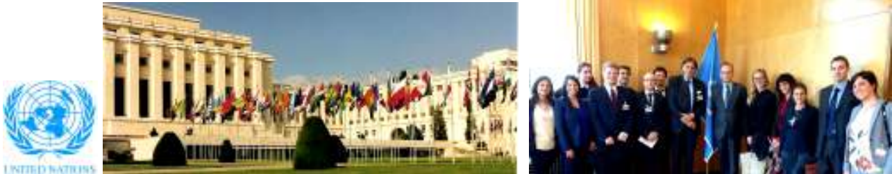
AESI DELEGATION WITH THE UNOG GENERAL DIRECTOR IN GENEVA