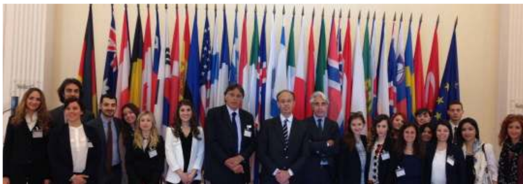
AESI DELEGATION WITH THE ITALIAN AMBASSADOR TO THE INTERNATIONAL ORGANIZATION IN PARIS