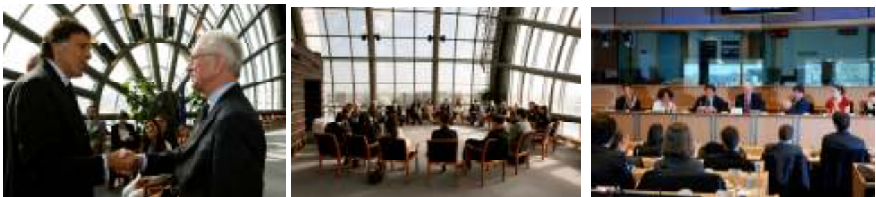
EUROPEAN PARLIAMENT – PRESIDENT OF EUROPEAN PARLIAMENT AND PRESIDENT AESI - BRUXELLES

I wish that the United Nations and the European Union would renew guided by a solidarity culture and courage of peace!