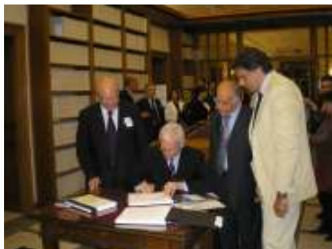
PRESIDENT OF EUROPEAN PARLIAMENT WITH THE RECTORS OF HEBREW AND AL QUDS UNIVERSITIES IN JERUSALEM AND PRESIDENT AESI

Palazzo San Macuto - Italian Parliament 24 June 2008