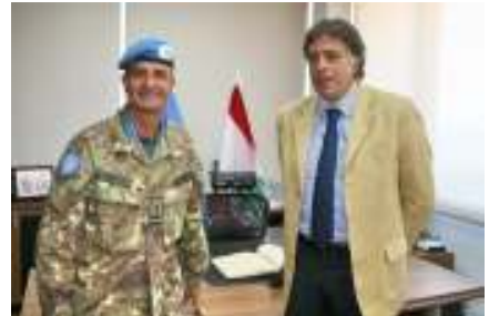
GEN CLAUDIO GRAZIANO AND GEN PAOLO SERRA - UNIFIL LEBANON