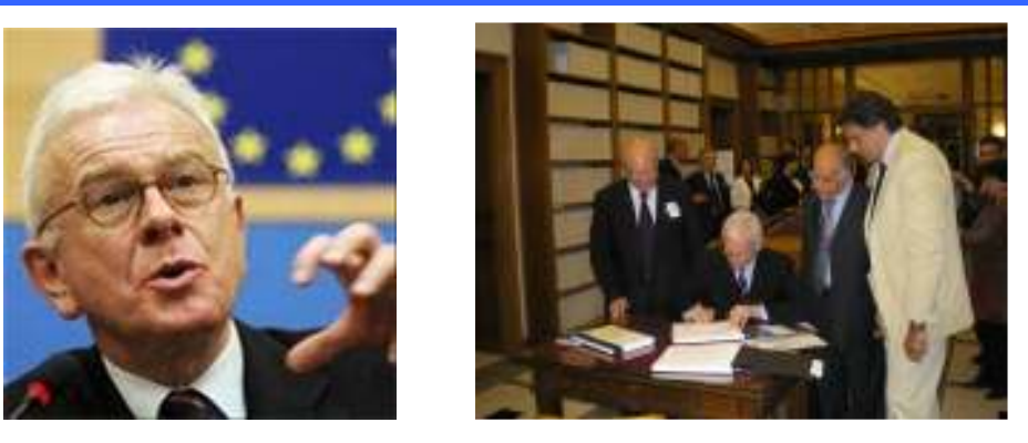
PRESIDENT OF EUROPEAN PARLIAMENT WITH THE RECTORS OF HEBREW AND AL QUDS UNIVERSITIES IN JERUSALEM AND PRESIDENT AESI